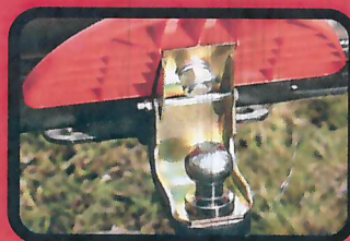
Ball Hinge Adaptor