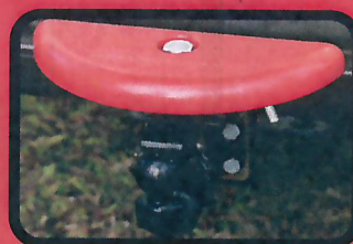
Pintal Hinge Adaptor