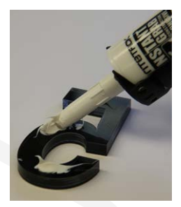
Apply the adhesive as required... beats drilling and screwing any day!.