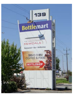
Doesn't this sign look great, assembled on site in less then half the time with no ualv fixings like screws and rivets!