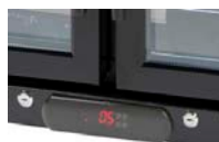
0 – 10 degrees electronic temperature control