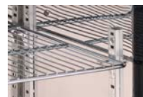
Chrome adjustable shelves