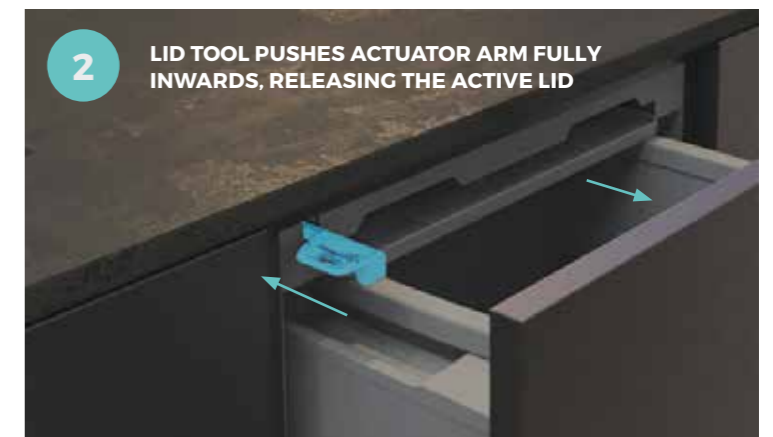
2 LID TOOL PUSHES ACTUATOR ARM FULLY INWARDS, RELEASING THE ACTIVE LID