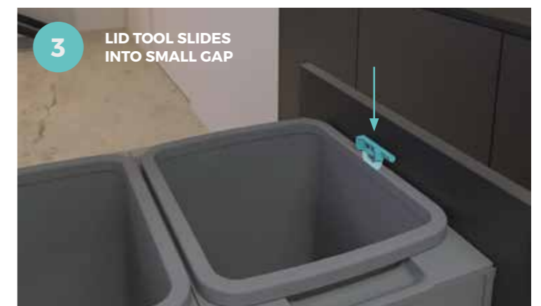
3 LID TOOL SLIDES INTO SMALL GAP