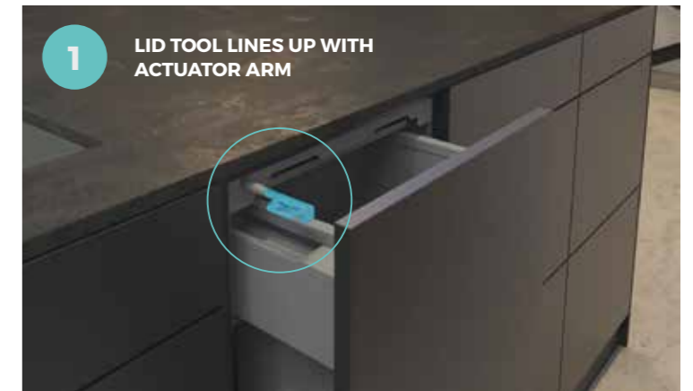
1 LID TOOL LINES UP WITH ACTUATOR ARM