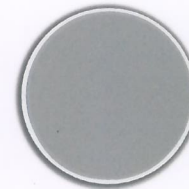
Whisper Grey Metallic