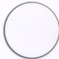
Sheer Bliss White