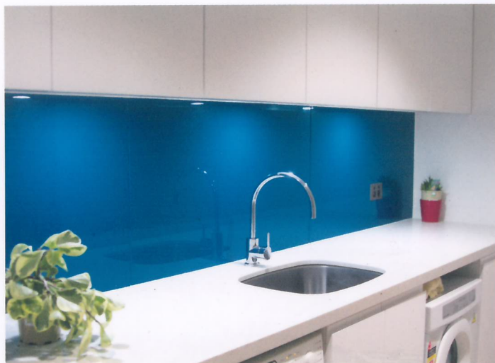
Laundry splashback in Reef Metallic

This cost effective wall panelling solution is durable, easy to install and highly versatile. Reflections offers extra flexibility thanks to its ability to fold and bend to follow curves and corners therefore limiting joint lines for a seamless finish. It can suit a variety of vertical applications and makes an outstanding statement in any room including kitchens, bathrooms, laundries and entertainment areas.