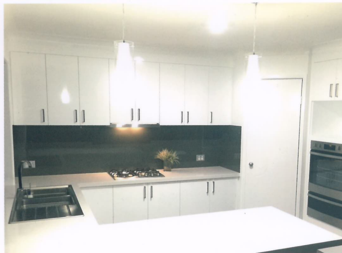
Kitchen splashback in Pepper Metallic